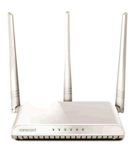
Model No. RNH326